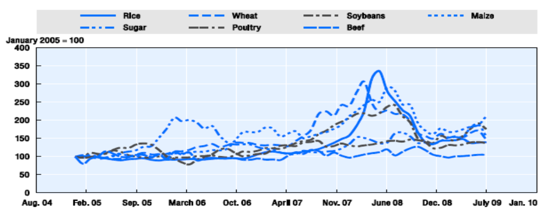
Figure 3. Co-movements of agricultural food crop price

production of biofuels. This impact was largely crop-specific and included maize in the United States, vegetable oils in the EU, and to a lesser extent, sugar in Brazil. Mandated consumption targets for biofuels, and other support policies further re-enforced the links between energy and feedstock prices.