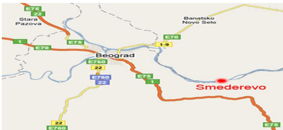
Figure 1. The geographical position of the City of Smederevo